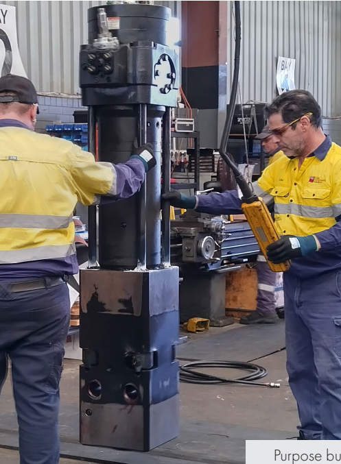
Purpose built equipment for factory quality rebuilds