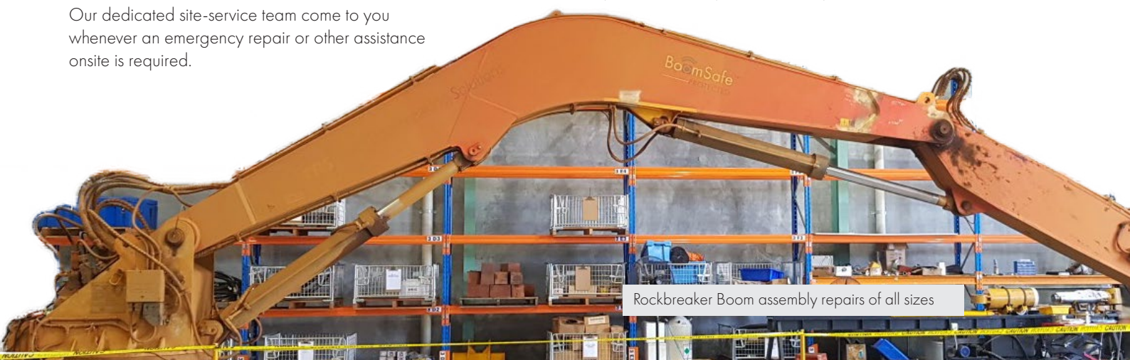
Rockbreaker Boom assembly repairs of all sizes

TRS technicians have a broad base of know-how related to attachment installation and operation and understanding how the attachment should function in your application to ensure it performs at its optimal efficiency.