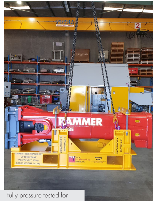
Fully pressure tested for constant power settings

Maintaining a regular servicing schedule for your boom systems and attachments is the best way to ensure your equipment perform at its optimal efficiency, and to prolong the life of your investment. It also helps you avoid unnecessary downtime.