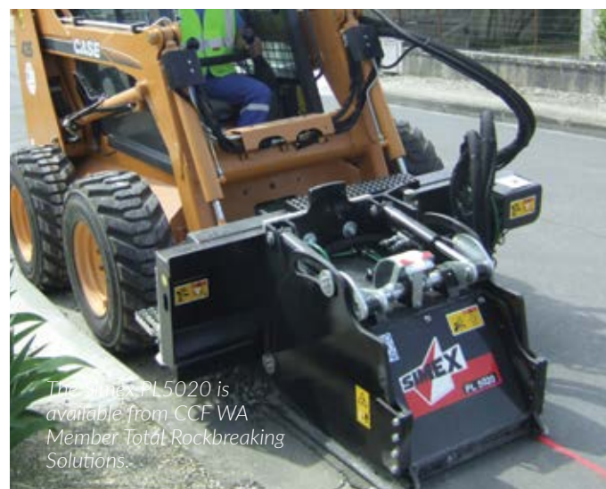
The SIMEX PL 5020 is available from CCF WA Member Total Rockbreaking Solutions.

For more information contact CCF WA Member Total Rockbreaking Solutions.