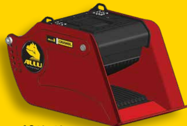
AC 10 - 16