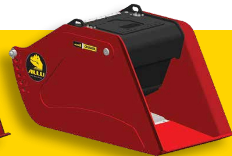
AC 25 - 37