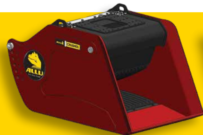
AC 20 - 22